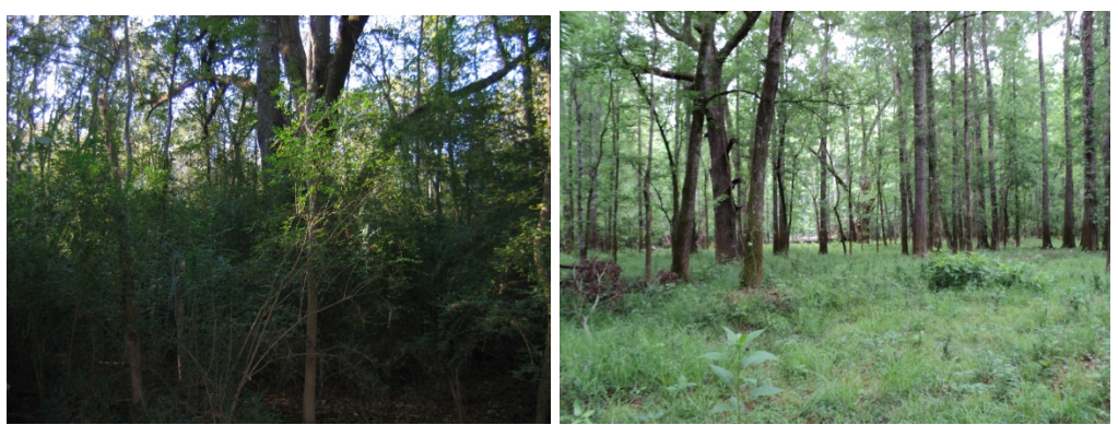
Figure 10. Poor pollinator habitat invaded by an understory shrub (left) and good pollinator habitat providing open areas for forbs and small shrubs to bloom. (right).

Promoting Native Plant Communities Along Roadsides for Pollinators