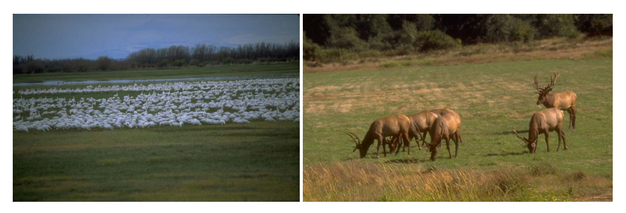
Figure 19. Abundant wildlife including snow geese (left) and elk (right) rely on public lands for habitat, as do pollinators.