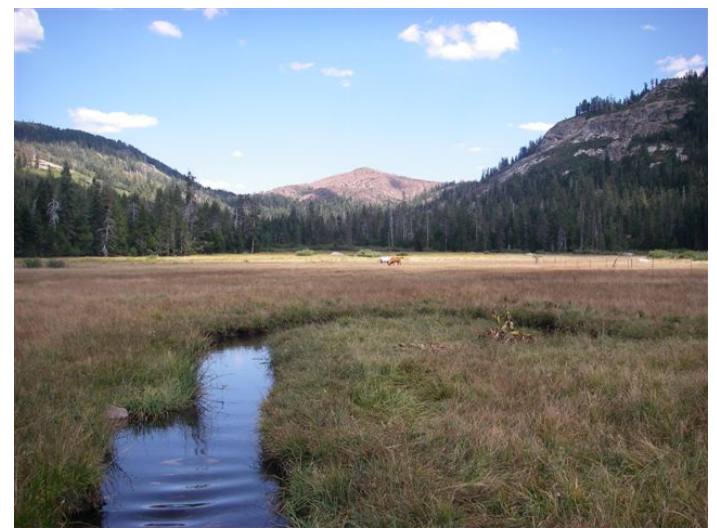
Figure 17. Cattle grazing in a meadow with pollinator habitat.