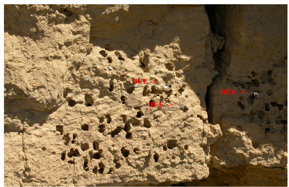
Figure 4. Bee nesting aggregation in an arroyo wall in the Carrizo Plain National Monument.

Site-specific prescriptions should be developed to enhance or protect the habitat elements necessary for a particular pollinator or group of pollinators to successfully nest or overwinter. For example, deep-soil disturbance near nest sites should be minimized, shrubs with pithy or hollow stems should be planted/protected, dead limbs, logs, and snags should be maintained whenever possible, some areas of bare soil for ground-nesting bees should be left, and/or disturbing larval host plant areas should be avoided.