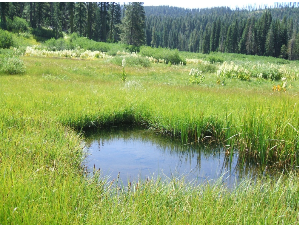
Figure 3. A clean, reliable source of water, like this high-elevation meadow with open water, is essential to pollinators. Running water and ponds provide resources for drinking. Water sources that are shallow or have sloping sides allow for easier approach without drowning.

Site-specific prescriptions are discussed in subsequent sections and should be developed after documentation of environmental effects.