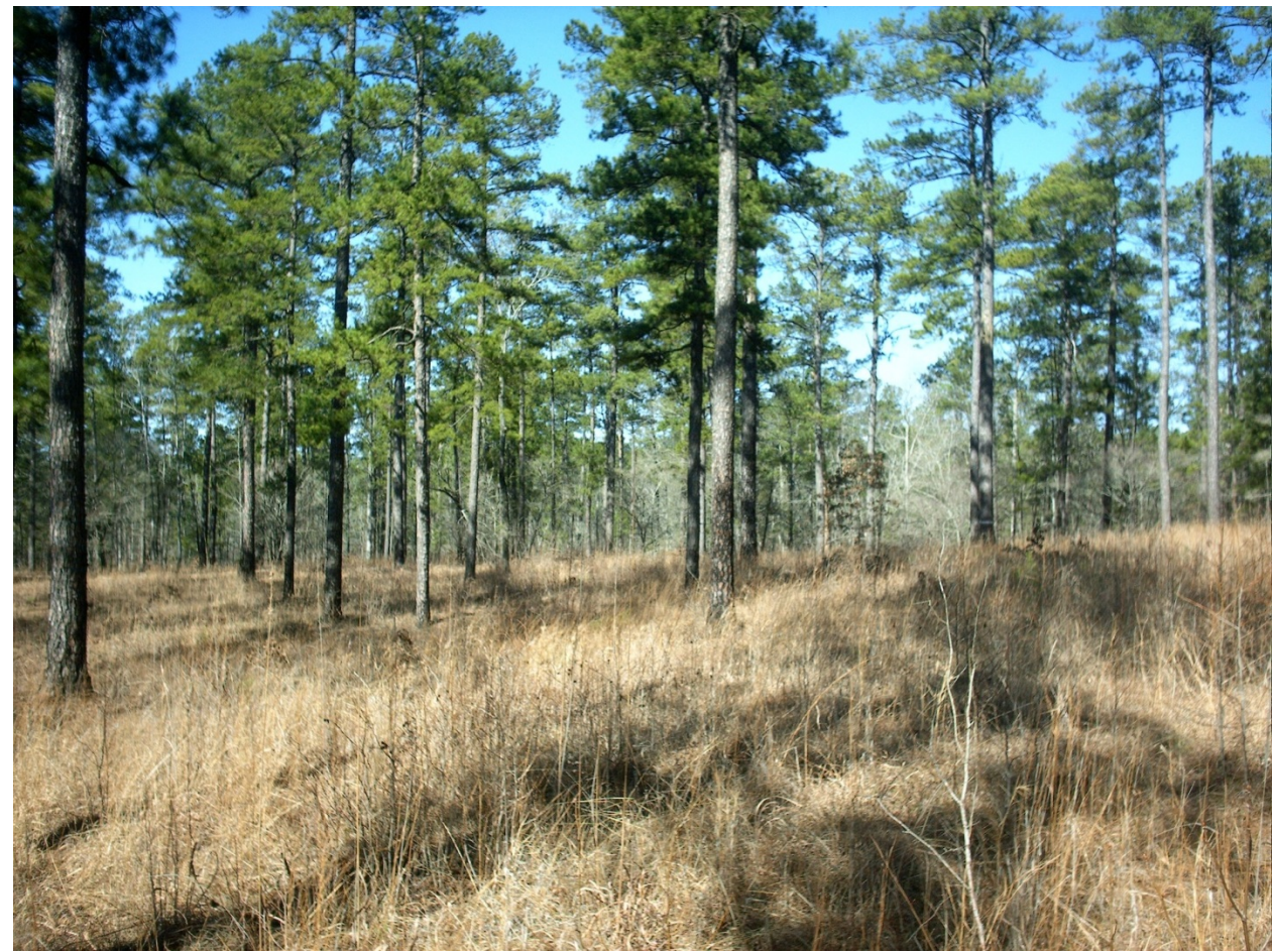
Figure 9. Successful thinning project in a southeastern pine savanna that now provides excellent pollinator habitat.