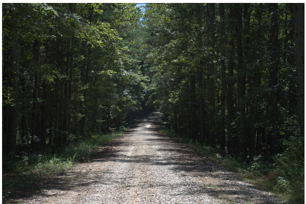
Figure 11. Dense roadside trees and overhanging canopy result in poor pollinator habitat.