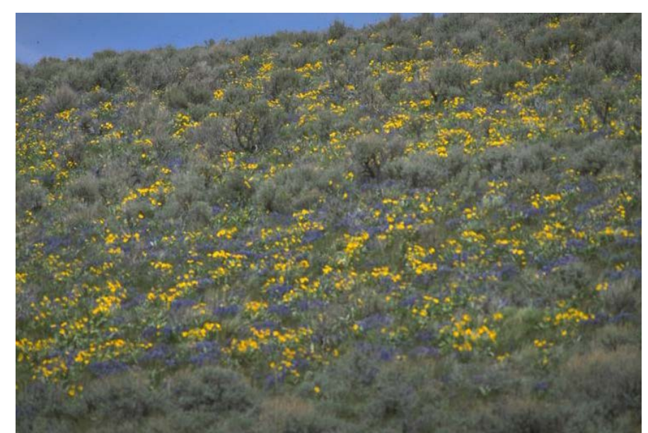
Figure 2. A sagebrush plant community with blooming forbs that provides forage for pollinators.

For additional information on pollination and pollinators, see the on-line material at http://dx.doi.org/10.2111/RANGELANDS-D-11-00008.s.1 . Associated with the June 2011 special issue of Rangelands Volume 33 Number 3 Pollinators in Rangelands.