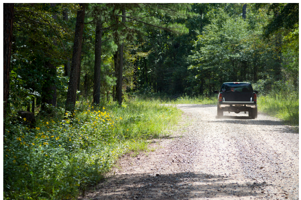
Figure 12. Roadside management results in canopy openings for good pollinator habitat.

Arid and Semiarid Western Shrublands—Seeding Native Forb Species in Restoration, Rehabilitation, and Revegetation Efforts