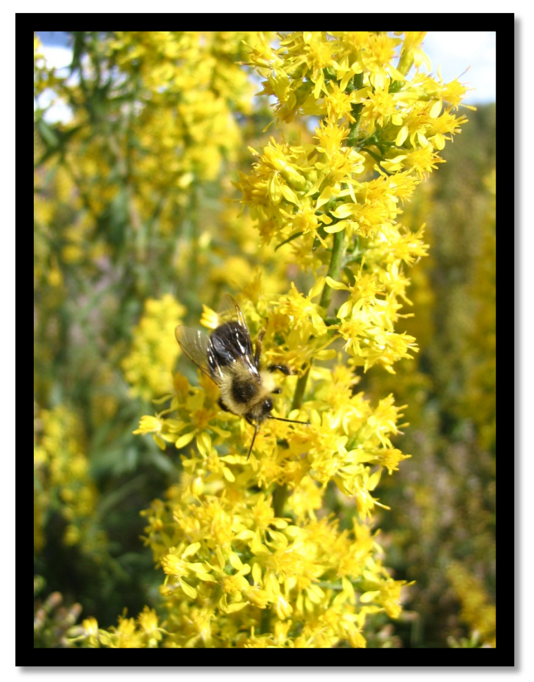
Bumble bee foraging on goldenrod, Solidago sp.