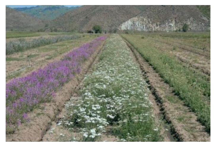
Figure 8. A native seed production field.