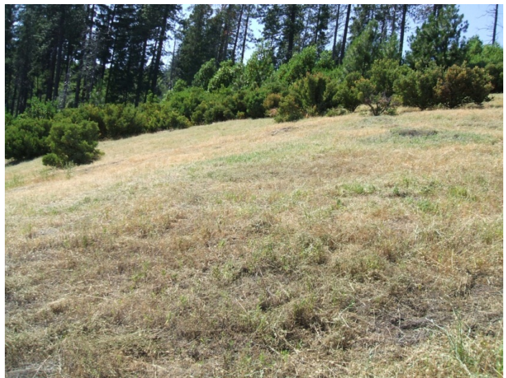
Figure 18. A dry meadow that was mowed for yellow star thistle control.