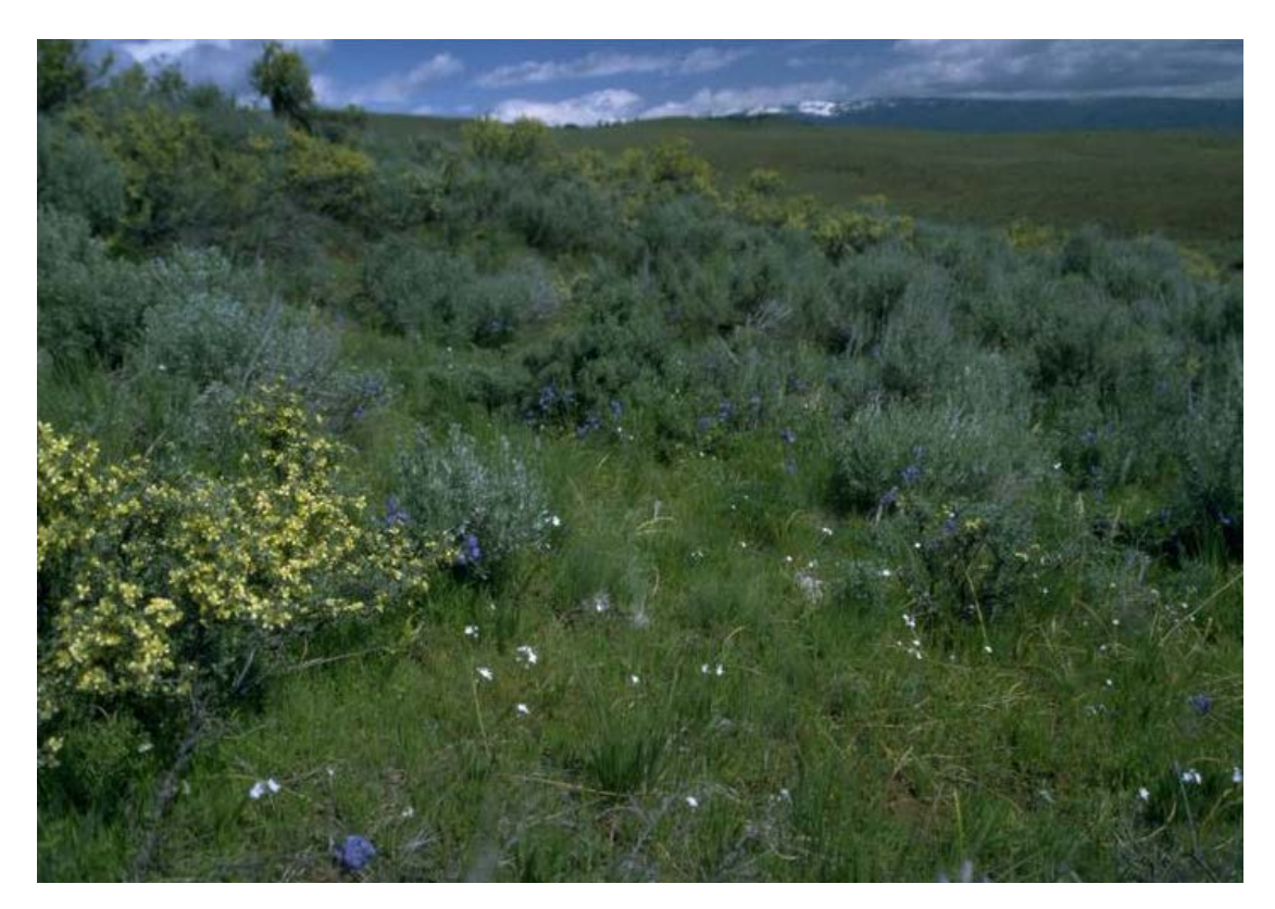
Figure 15. Wildlife opening in sagebrush habitat with structure and diversity that can benefit pollinators.