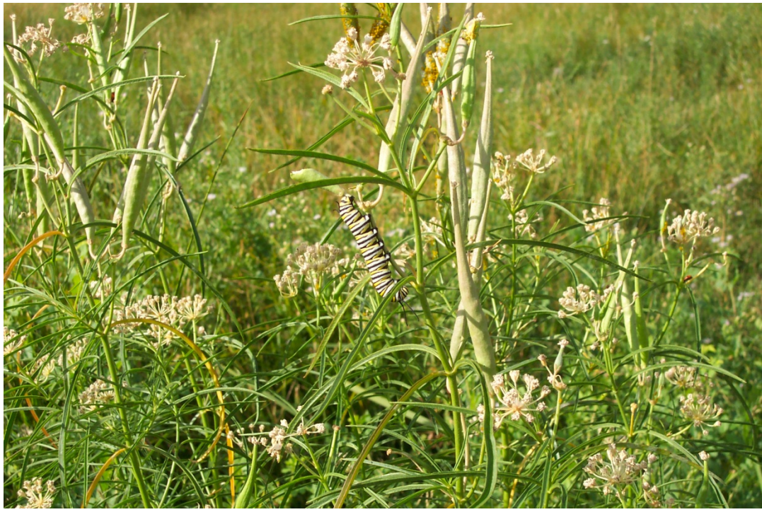
Figure 20. A monarch butterfly caterpillar on flowering narrow leaf milkweed.

Placement of Honey Bee Hives on BLM and U.S. Forest Service Lands