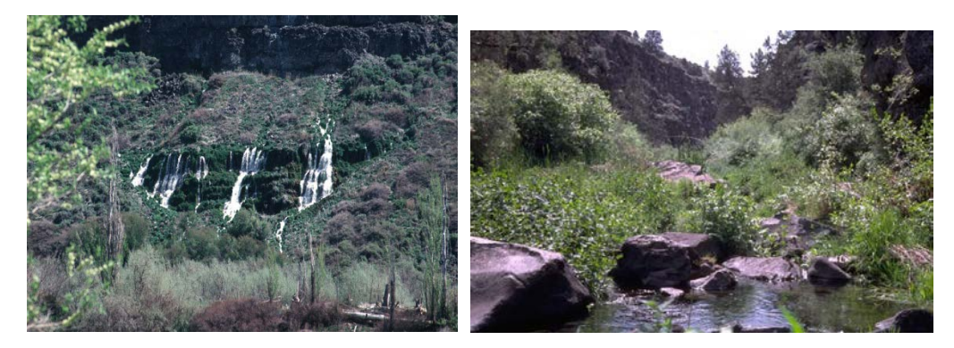
Figure 14 . Riparian areas, including those around spring and seeps (left) and those around streams (right), can provide diverse pollinator habitat.

Managing Wildlife Openings To Improve and Sustain Pollinator Habitat