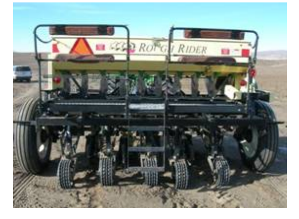
Figure 13. A minimum till drill.

Grasslands—Conversion to Native Meadows and Prairies