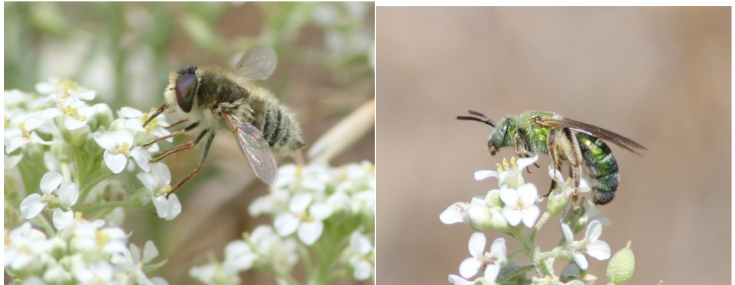
Figure 5. A bee fly (left) and a sweat bee (right) pollinating slickspot peppergrass, a rare listed plant species from Idaho. Flowers of this species that are insect pollinated produce more seed than those that are self-pollinated (photographs by Ian Robertson).