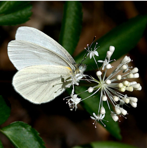
Figure 6. A West Virginia White butterfly laying eggs on nonnative garlic mustard. Toxins in garlic mustard can kill the larvae when they hatch.