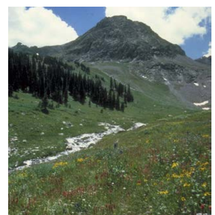
Figure 1. Pollinator habitat in an open landscape with good sun exposure and many different types of flowering forbs.

The best pollinator habitat sites for foraging are open landscapes with good sun exposure and many different types of herbaceous plants. Habitat patches that are bigger, rounder, and closer to other patches are generally better than those that are smaller, uneven in shape, and isolated. Habitats with a variety of native flowering plants that have overlapping blooming times and that are adapted to local soils and climates are usually the best sources of nectar and pollen for pollinators (Black et al, 2007). Some pollinators are limited in the distance from their nesting sites they can forage. For example, no bee is likely to travel more than 1.5 kilometer (about 0.9 mile) from its nesting site, and most are likely to fly distances that are significantly less (Gathnann and Tscharntke, 2002). Bumble bees and honey bees, however, provide notable exceptions, easily flying 1 mile in the case of bumble bees and 2–4 miles in the case of honey bees.