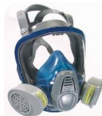
Full-face Air Purifying Respirator with N95 particulate filters