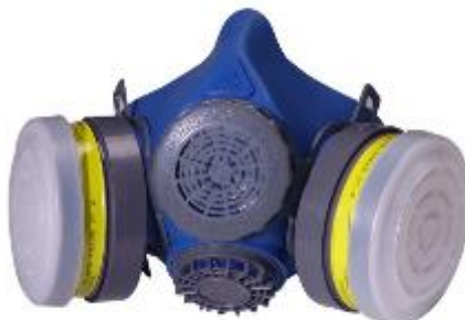
Half-face Air Purifying Respirator with N95 particulate filters