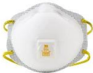
Disposable Filtering Facepiece N95 Respirator

For example if the label requires minimum of a Disposable Filtering Facepiece N95 Respirator (photo on lower left):